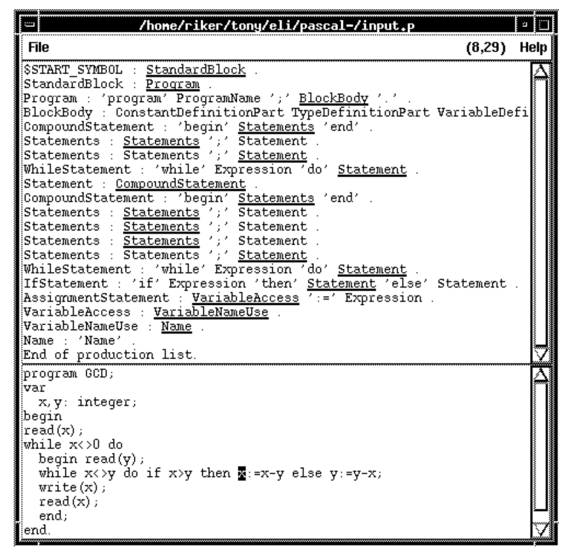
Figure 3. Eli Parsing Monitor