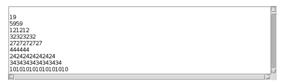
Figure 3: Uncustomized fileWatch

You can customize the fileWatch widget by modifying the appearance of the text widget and info labels, adding a top label and a new button to archive the displayed file with this script: